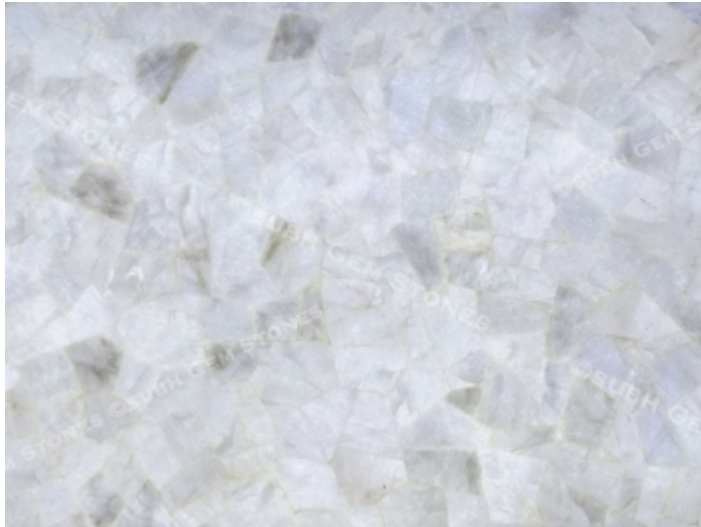
White quartz stone

White quartz stone, known for its stunning white hue, is a natural mineral composed mainly of silicon dioxide. It's coveted for its remarkable resemblance to marble and its ability to elevate the overall look of any setting. In the world of interior design and architecture, the choice of materials plays a pivotal role in shaping the aesthetics of a space. One material that has been gaining popularity for its timeless beauty and versatility is white quartz stone. Subh Gem Stones, a renowned name in the industry, has been at the forefront of providing exquisite White quartz stone slabs that are redefining the way we perceive elegance and sophistication in interiors. Elevate your interior spaces with the elegance and sophistication that only white quartz can offer.